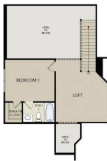
OPT. BEDROOM 5 WITH BATH 4