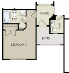
OPT. BEDROOM 4 WITH BATH 3