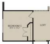
OPT. BEDROOM 5