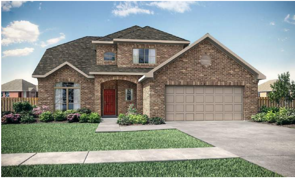
Burleson Elevation A