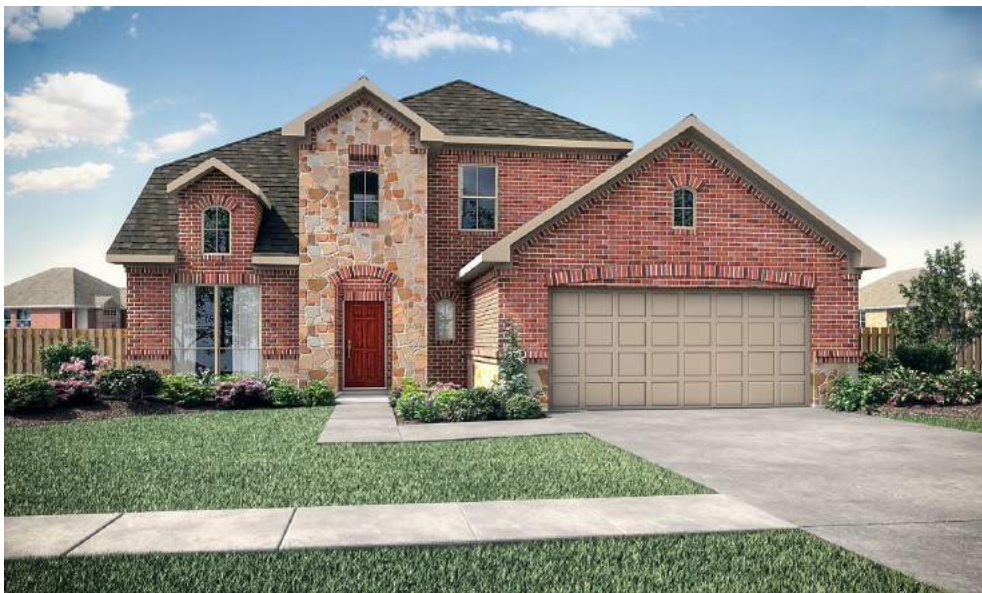
Burleson Elevation C