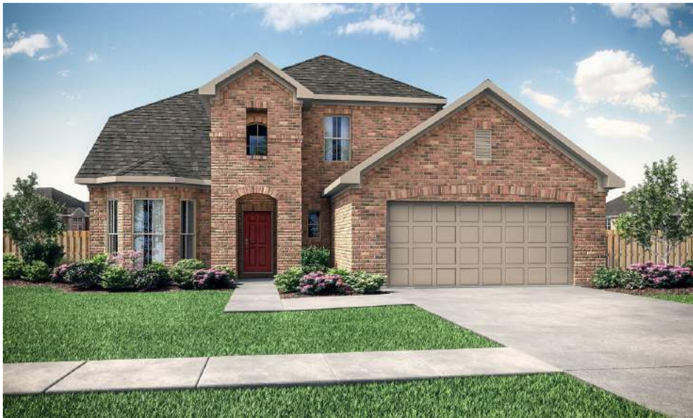
Burleson Elevation B