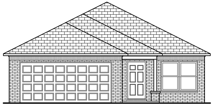
Carlisle Elevation B