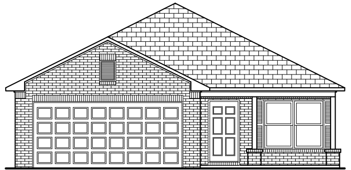
Carlisle Elevation D