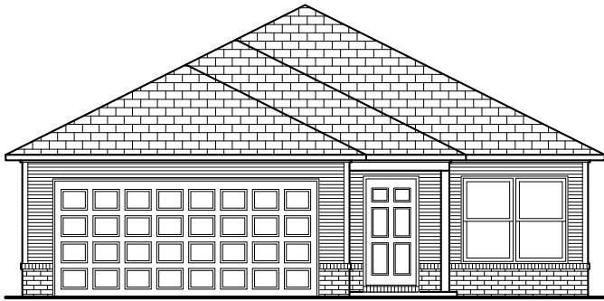
Carlisle Elevation A