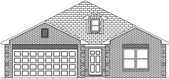
Foster Elev. E