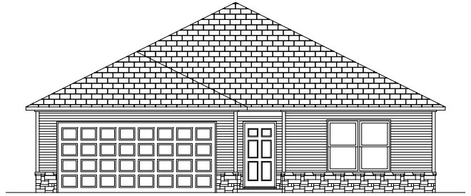
Foster Elev. G