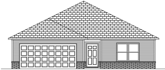
Foster Elev. A