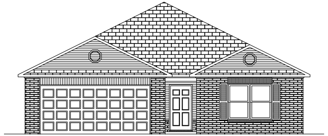
Foster Elev. D