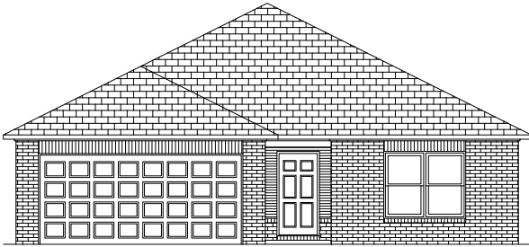
Foster Elev. C