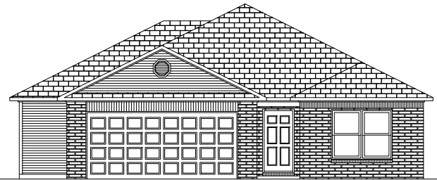
Taylor Elev. C