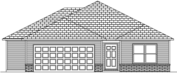
Taylor Elev. A