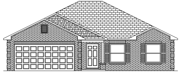
Webster Elev. D