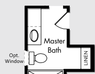
Opt. 3x5 Shower