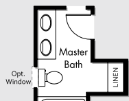
Opt. Double Vanity