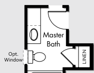
Opt. Linen Closet Door