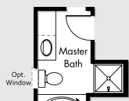
Opt. Shower & Soaking Tub