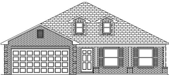
Webster Elev. E