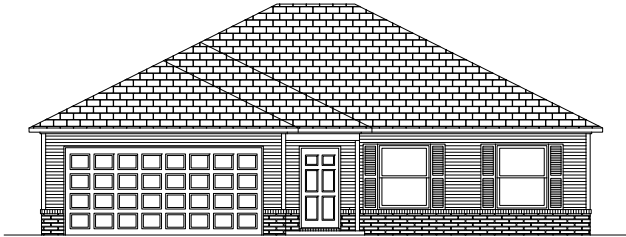
Webster Elev. A